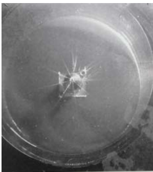
Injector spray pattern without FUEL PREPARATOR

The AirDogII DF 180/240 Adj overcomes the inadequacies of the conventional vacuum feed system. Removing entrained air from the fuel and preventing vapor from cavitation restores injection timing and engine performance to insure maximum power output and peak efficiency at all times!