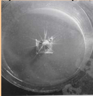
Injector spray pattern without FUEL PREPARATOR

The conventional vacuum feed fuel supply system does nothing to remove entrained air from the fuel. In fact, it only makes things worse. As the filter plugs with the use or when the diesel is used at higher altitudes, the already inadequate fuel flow to the engine is further reduced, increasing cavitation and retarding injection timing even more.